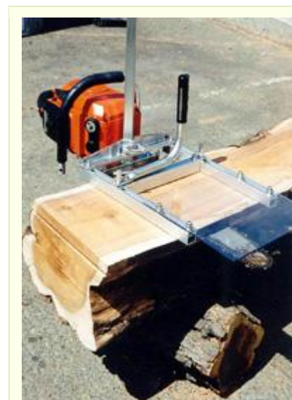
Granberg International Alaskan Small Log Milling Attachment