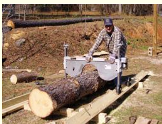
Lumber Smith Portable Band-saw Mill

Competitive band-saw mills range from $2,500 to $35,000, depending on the bells and whistles. The Lumber Smith has very few bells and no whistles; instead, it offers simplicity, a 105-pound weight and a rugged design. A 5.5-horsepower Honda engine drives the saw blade on its three-wheel frame. Simple adjustments keep the blade running true. One person can easily take the saw to the log, and the saw can be stored in an area as small as 15 square feet when not in use. The company includes plans for a framework made with 2-by-4s and 2-by-6s to hold the log in place and off the ground and keep the sawmill running parallel to the log.